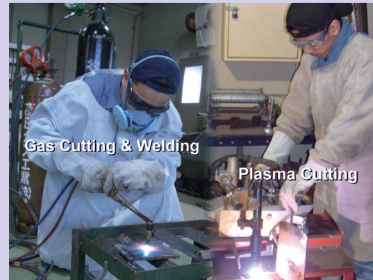
Gas Cutting &amp; Welding

From April 10, 2025 (Thursday) to September 5, 2025 (Friday) (There are no classes on Saturday, Sunday and public holiday)